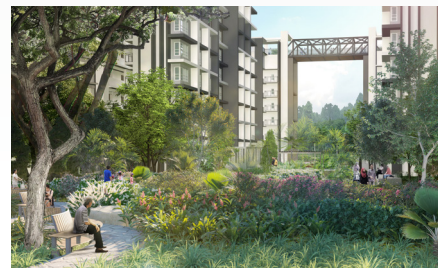
Enhanced common areas with lush planting and seating areas for quiet contemplation.